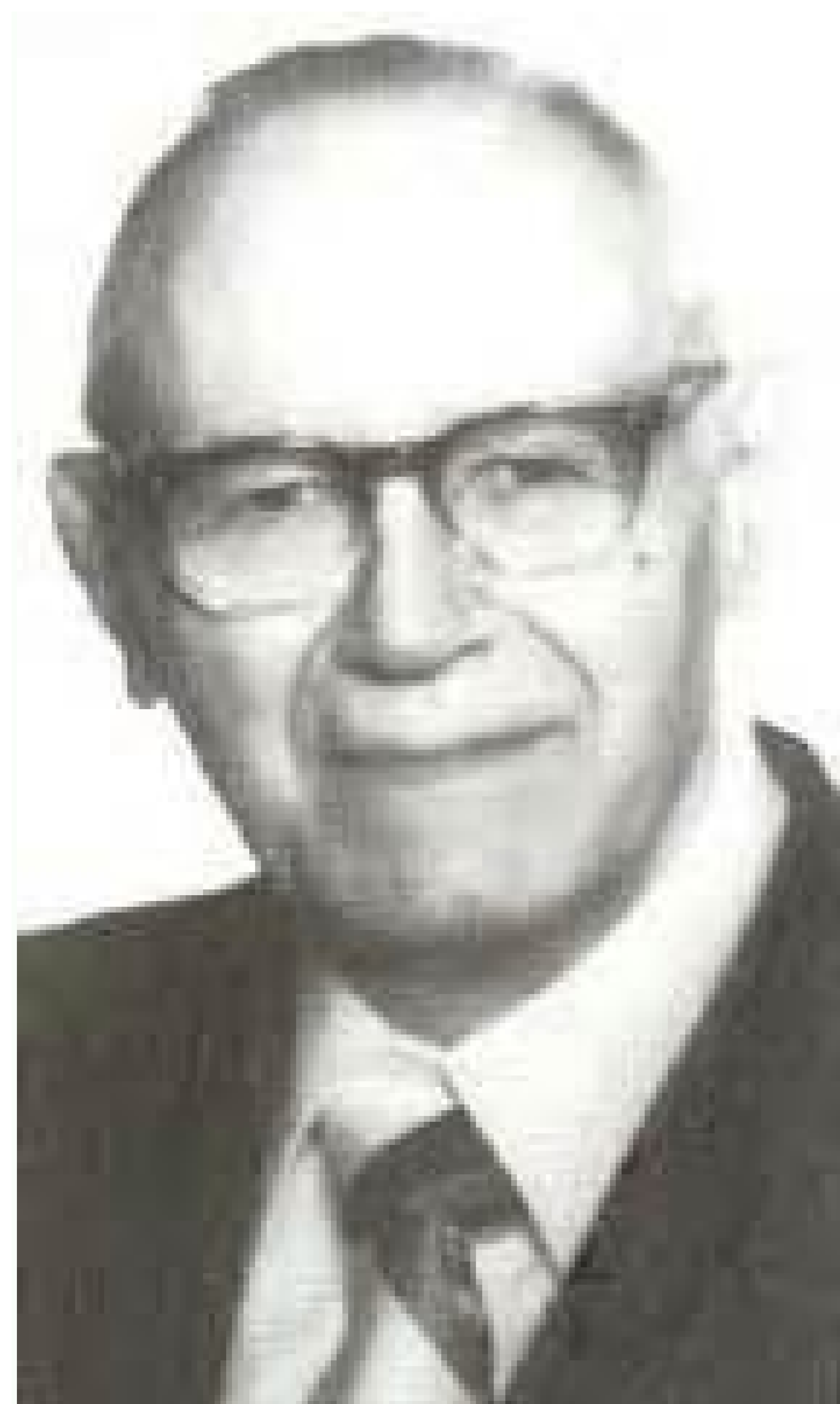
Campbell-bannerman report 1907. Campbell-bannerman report 1907.pdf.